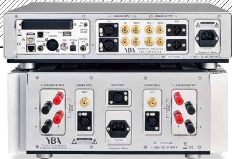
ABOVE: Novelties are revealed to the rear: preamp [top] packs an Apple AirPlay module to the left, below which are network and I 2 S digital connections on RJ45 sockets. The 'extra' mono XLR input on the power amp is for bridged operation

warm, yet with high levels of detail and no blurring or overt smoothing of the treble to spoil things. It's worth noting that, if you should find yourself only using the analogue inputs, switching off the digital section brings a worthwhile, if relatively subtle, gain in clarity.